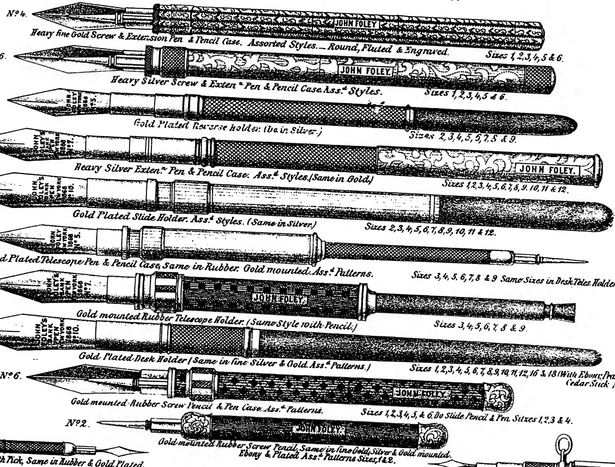
Fine Gold Screw Tooth Pick, Same in Rubber & Gold Plated.